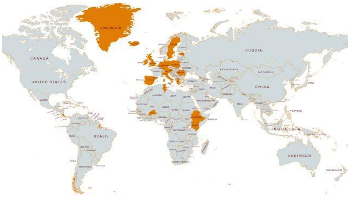
Figure 1. Map highlighting the countries of origin of SoilTribes micro-grant applications